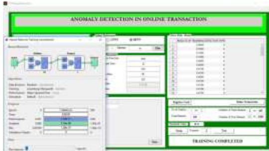
Figure 4.1: GUI of CPNN Detection System