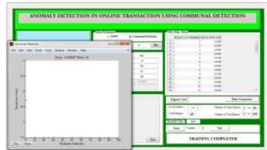
Figure 4.2: GUI of Communal Detection System

A simulator was used to generate cardholders transactions consisting of legal transactions intertwined with malicious types. The number of transactions used for training is 70% of total transactions and 30% are used for testing. The experimental results classified in terms of true positive (TP), true negative (TN), false positive (FP) and true negative (TN), and evaluated FPR, FAR, DR and ACC produced by CD, CPNN and CD-CPNN were presented in table 1, 2 and 3.